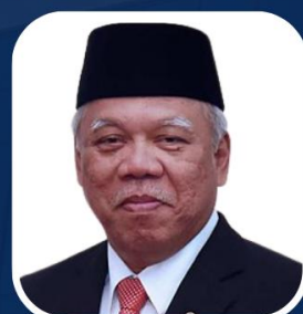
DR. IR. M. BASUKI HADIMULJONO, M.SC. Minister of Public Works and Public Housing Republic of Indonesia